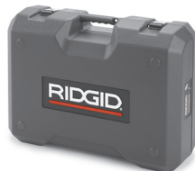
NaviTrack II Case